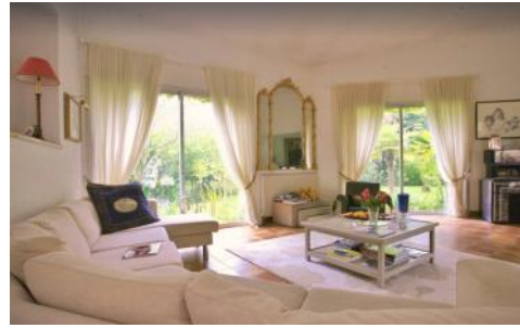
Open plan sitting room