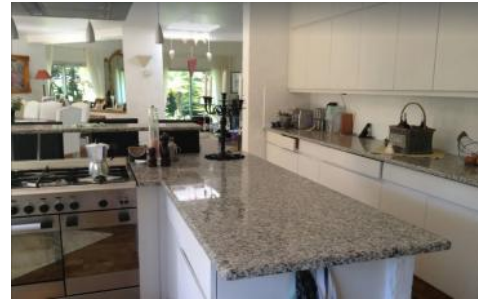
Open plan kitchen