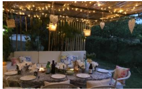
Fairy lit kitchen terrace