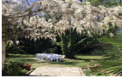
Garden table seating 10 under mature trees