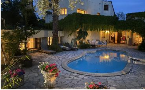
Evening by pool