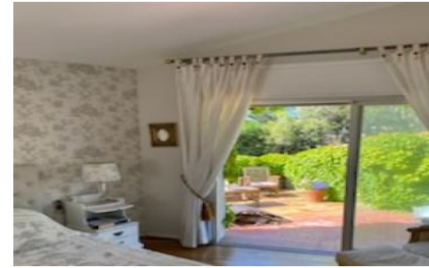
Main bedroom with king sized bed dressing room bathroom and sunny private terrace