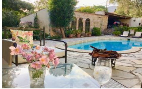
Rose wine by the pool watching sunset