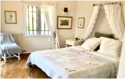
King bed private terrace overlooking pool and gardens