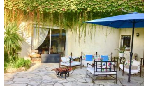
Terrace by pool