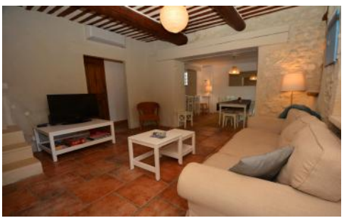
Mas living room