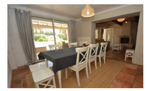
Mas dining area