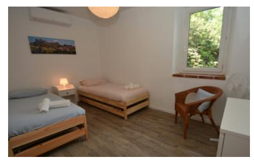
Mas bedroom 4