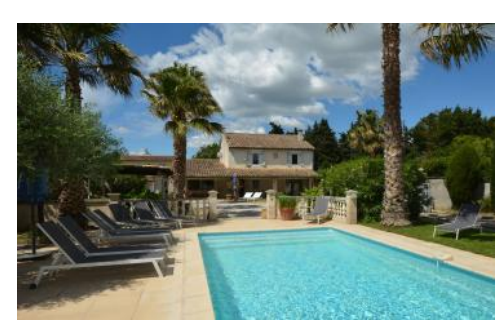
Mas view from pool