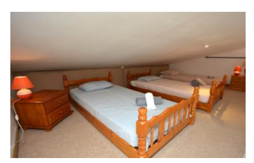
West wing mezzanine