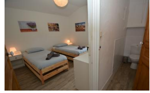
Mas bedroom 3