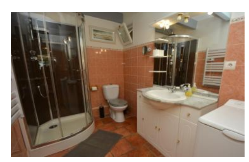
West wing bathroom