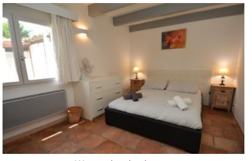
West wing bedroom