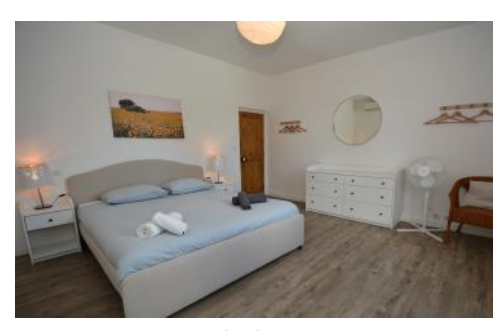
Mas bedroom 1