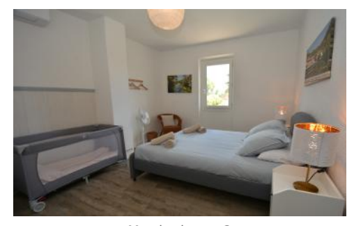
Mas bedroom 2