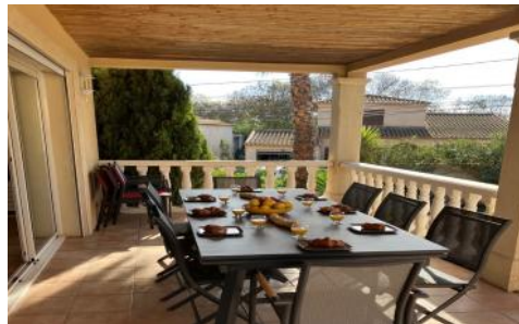
Terrace dining for 8-12