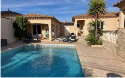
Plentiful outdoor spaces