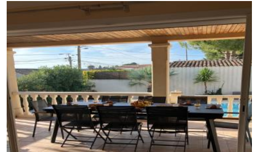
Terrace dining access