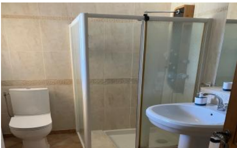
En suite bathroom