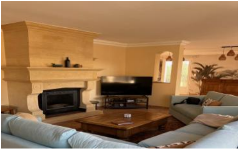
Living room TV watching