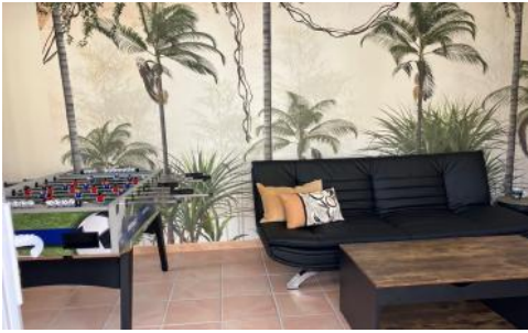
Guest house / Game room