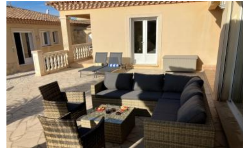
Outdoor living room