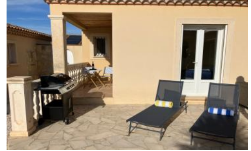
More sun lounging