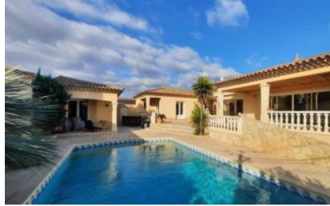
Welcome to Villa Picpoul