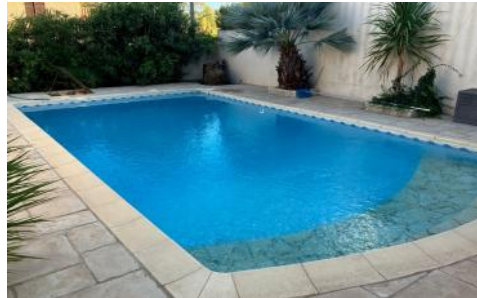
Pool with steps