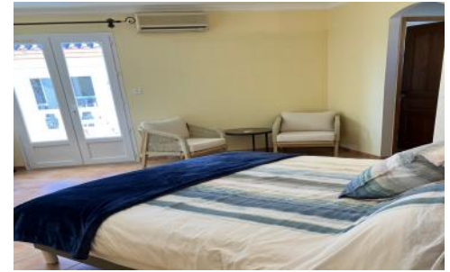
Master bdrm sitting area