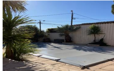
Pool safety cover for children