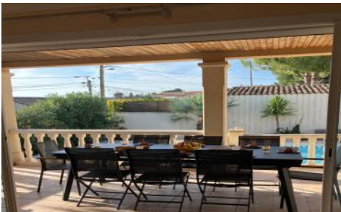
Terrace dining access