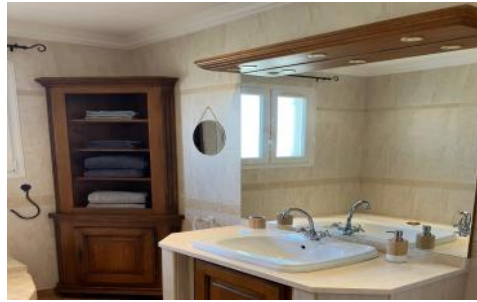
Main bathroom sink