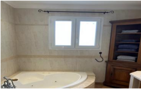
Main bathroom jacuzzi