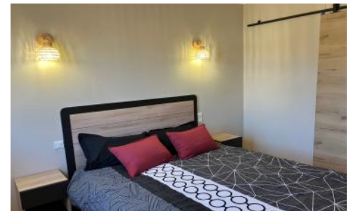
Bdrm4 Queen bed