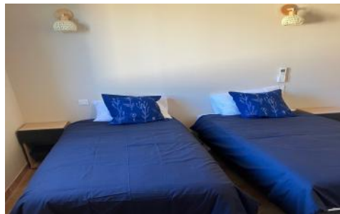
Bdrm2 Single beds