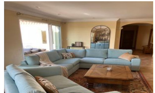
Living room seating