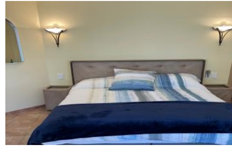
Master bdrm King bed