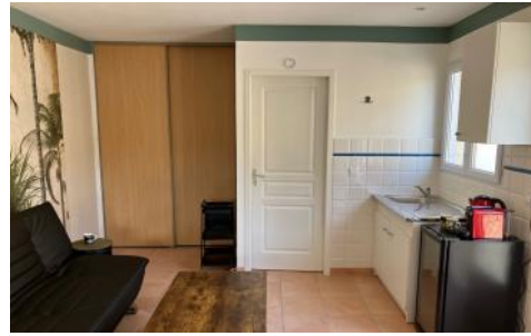
Guest house with bathroom