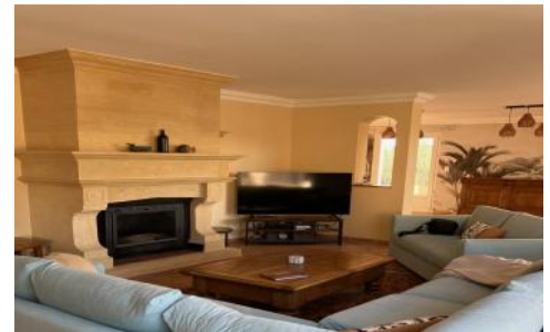
Living room TV watching