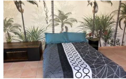
Guest house sofa-bed setup