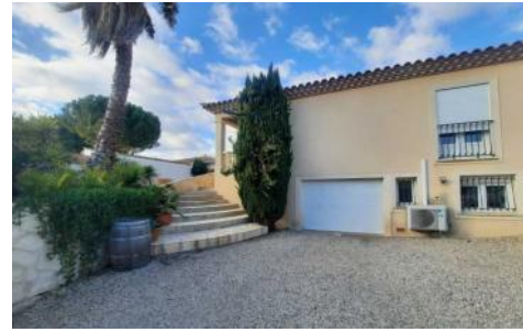
Garage and parking