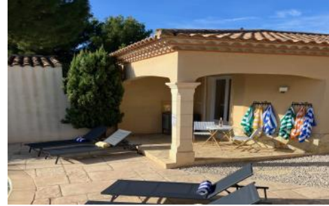
Guest house and sun lounging