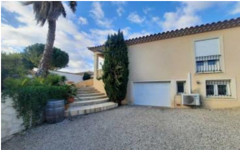
Garage and parking