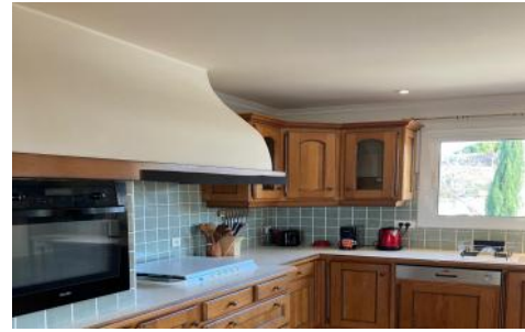
Kitchen cooking area