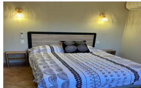
Bdrm3 Queen bed