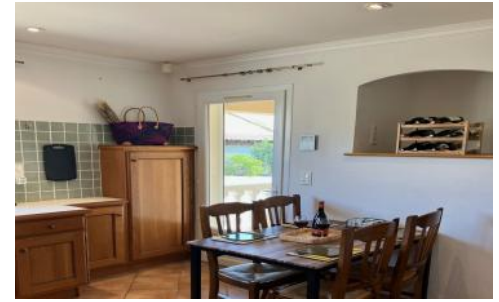
Kitchen dining area