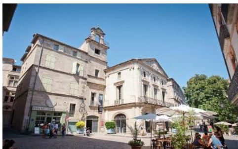
This is the centre of Mediaeval Pezenas, it's truly a great place to be as it has lots of little side streets to be explored. You can find ice cream shops, sweet shops, clothes shops, any kind of shop you desire, is somewhere in this town, so go exploring