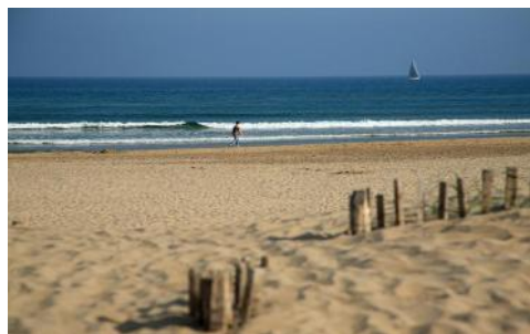
This is one of the many nearby beaches to be enjoyed around Pézénas.