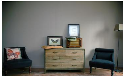
Another view of the interior of this fabulous apartment, as you can see it is very cosy and traditional.