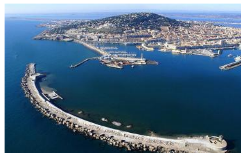
One of the must-see places in the South of France is of course, Sete and Mont St Clair. As you can see by this photo, both these places are amazing places to be with gorgeous sandy beaches!