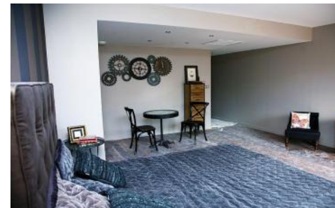
A view of the interior of this fabulous apartment, as you can see it is very cosy and traditional.