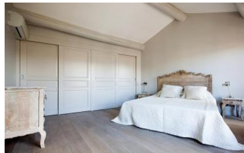
One of the bedrooms in this chic apartment. As you can see it is in a very spacious room and provides lots of sunlight.