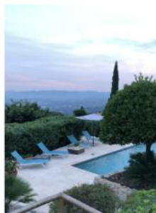
View from Terrace