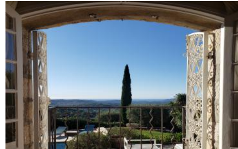
View from Master