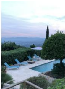
View from Terrace