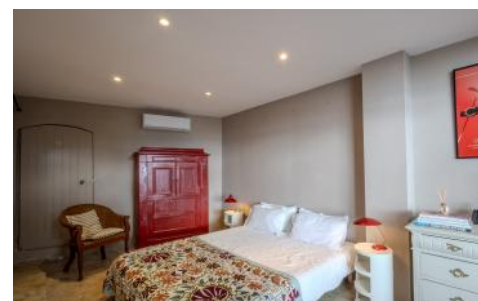
the red bedroom