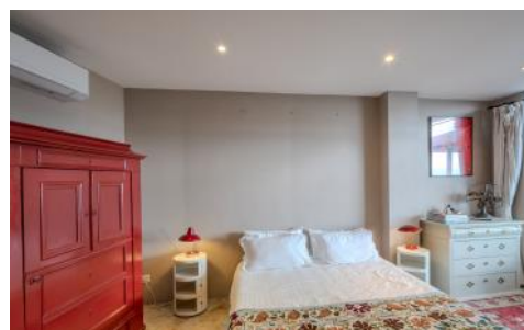
The red bedroom