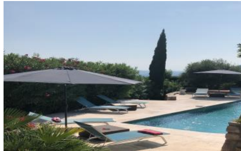
View from terrace