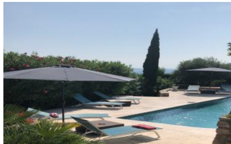
View from terrace