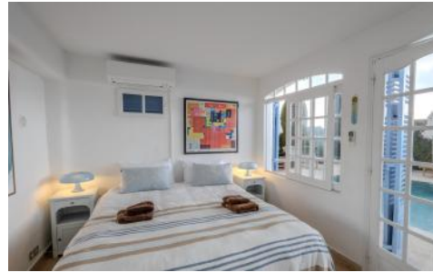
The blue bedroom