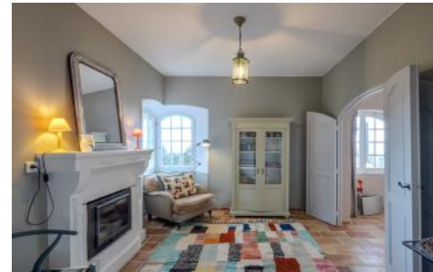
second living room