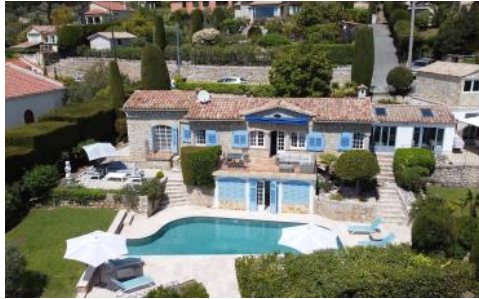
The front of the house